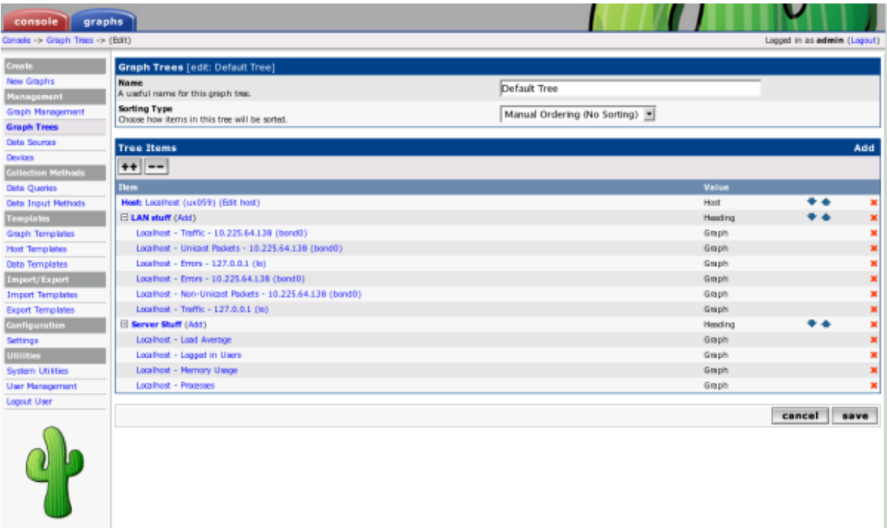
Figure 8-1. Editing a Graph Tree

Once you type a name, click the Create button to continue. You will be redirected to a page similar to the one below, but without all of the items.