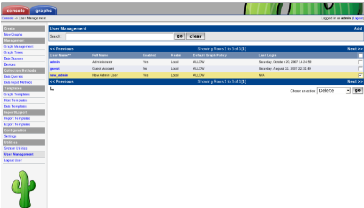
Figure 9-10. Delete Users Part 1

To delete a set of or a single user, select the User Management item under the Utilities heading on the Cacti menu. Once at the user management screen, select the user(s) you would like to delete and select delete from the Action selection