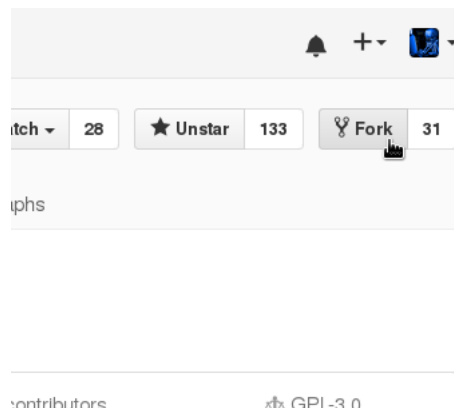
Fig. 1: Forking Paperwork on GitHub

The repository Paperwork 1 contains the GTK+ user interface. You will need a copy of this repository on your Github account in order to submit a pull request later.