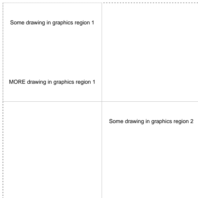
Figure 2: Defining and drawing in multiple graphics regions.